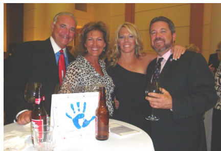
Guests enjoying good food and good company