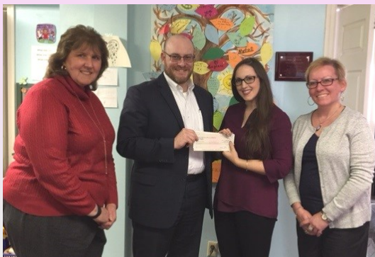
The First National Bank of Suffield presents Mary's Place with a check for donations raised of nearly $1,800!

Many thanks to our participating businesses and to all who donated toward this year's Have A Heart Fundraiser! Over $5,000 was raised to support our center and services.